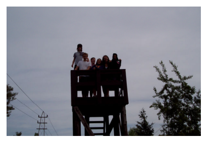
Field trip to the Utica Marsh by local students